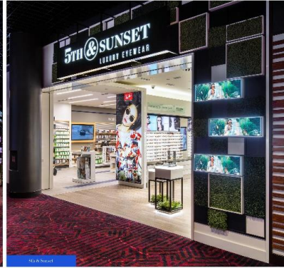
5th & Sunset